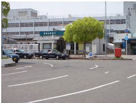
Taxi stand seen from the bus stop

It takes about 20 – 30 minutes to Wakayama Marina City and the fare will be 3000 – 3500 JPY.