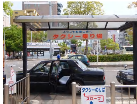
Taxi stand at JR Wakayama Station (East exit)